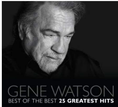
Chart-topping artist Gene Watson has been on the country music scene for 50 years now. To commemorate that golden anniversary, Watson is diving back into his five-decade catalogue to re-record his Top 25 songs for his 'Best of the Best: 25 Greatest Hits' record, available on Feb. 14. And his end goal is not to take a new spin on the tunes but, instead, to preserve each one and get it as close to the original recording as possible.